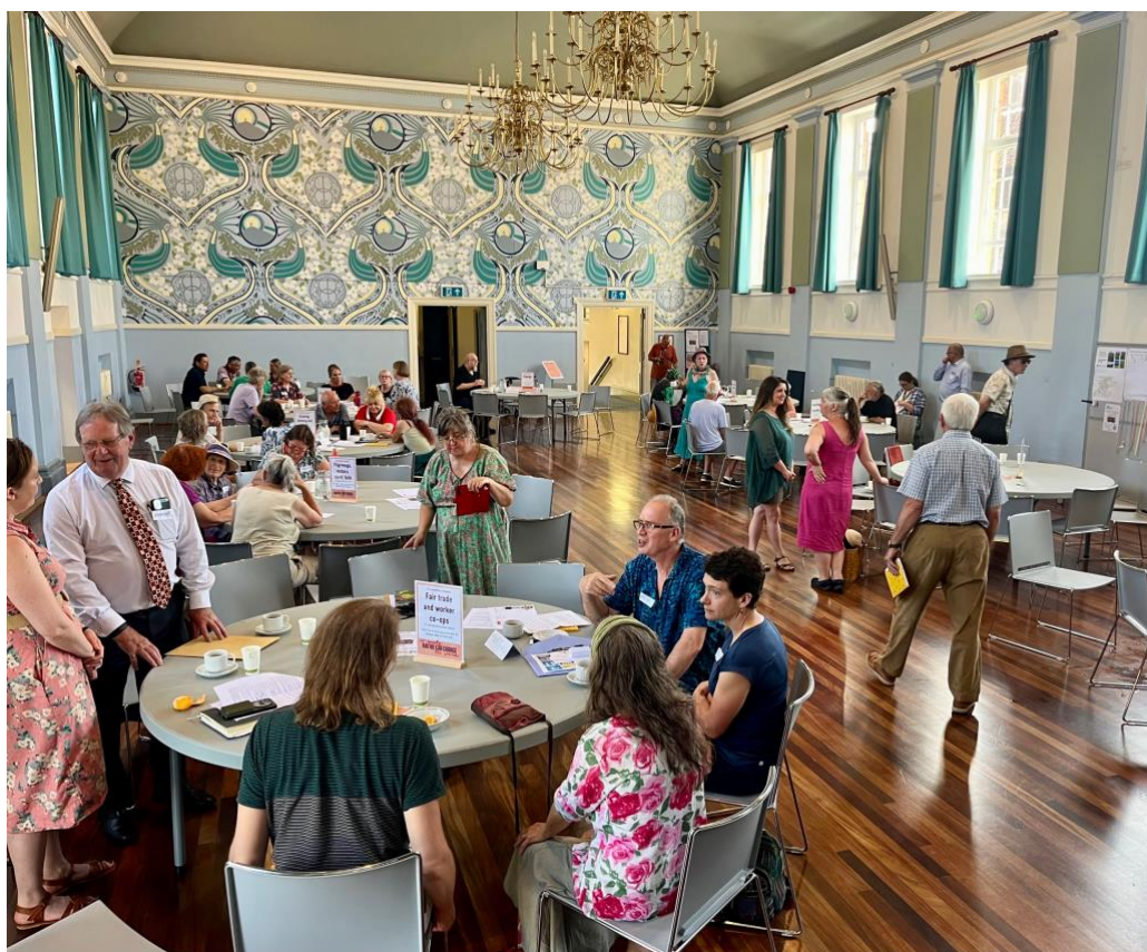
Glastonbury Co-op fair town hall

Glastonbury Town Council would like to thank all speakers, organisers, volunteers and attendees who helped make the Co-operative Fair such a positive, informative and inspiring event, and looks forward to continuing the conversations and partnerships that began on the day.