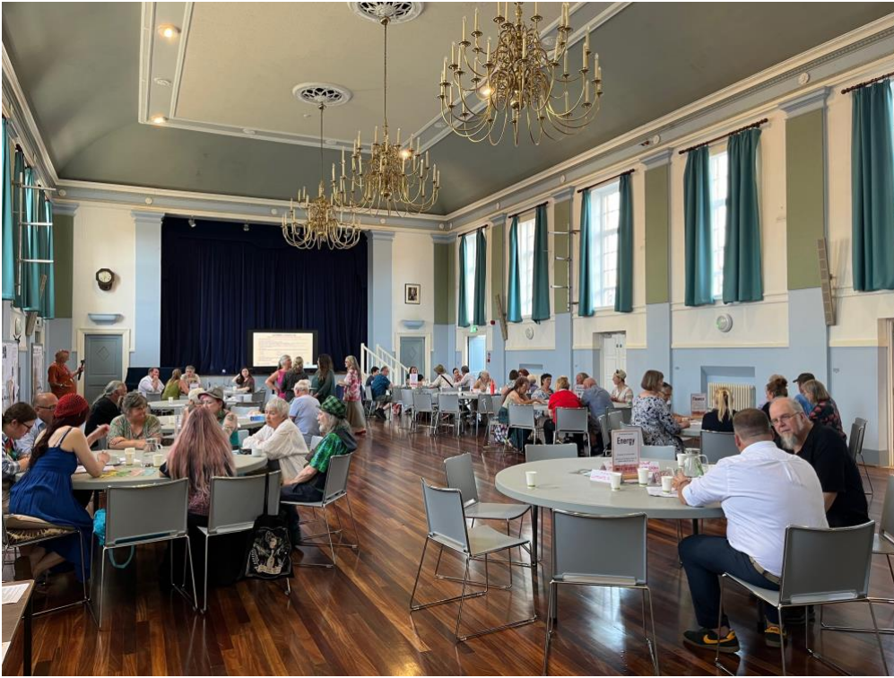
Glastonbury Co-op Fair town hall