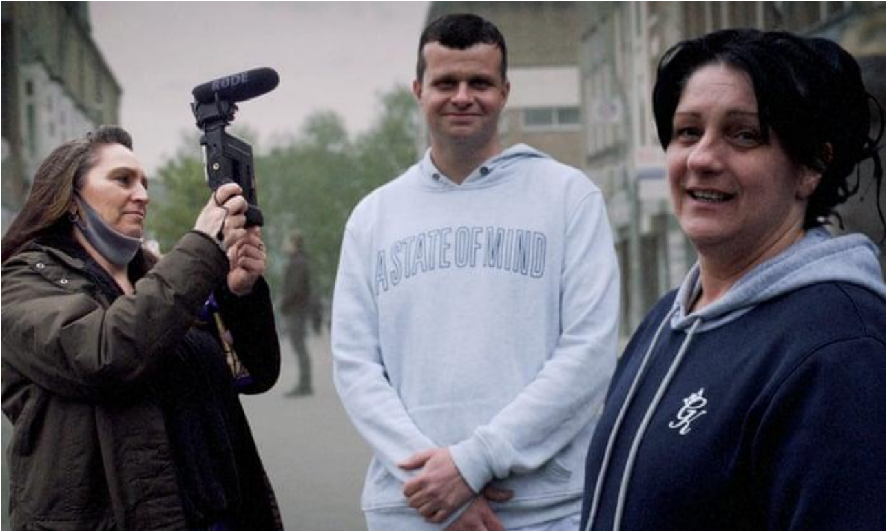
Filming - Made in Bury