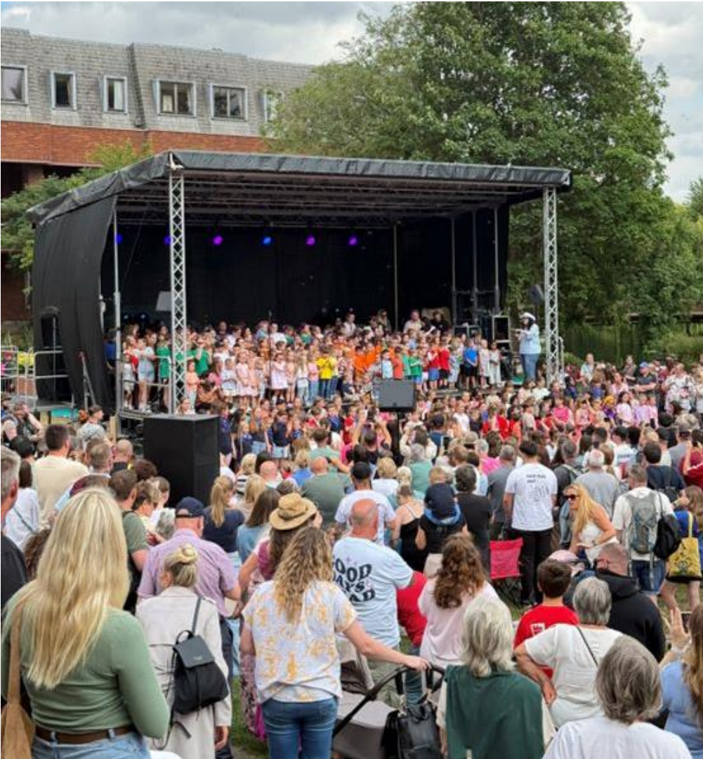
Kaleidoscope of Dreams Festival

Kaleidoscope of Dreams was a festival celebrating inclusion, co-designed by schools, young people and community partners. Hosted at Tamworth Castle Grounds, it united thousands of residents through music, dance, and art, many of whom had not previously participated in borough-wide events. Kaleidoscope of Dreams II – Better Together will take place in July 2026, once again led by our schools and communities.