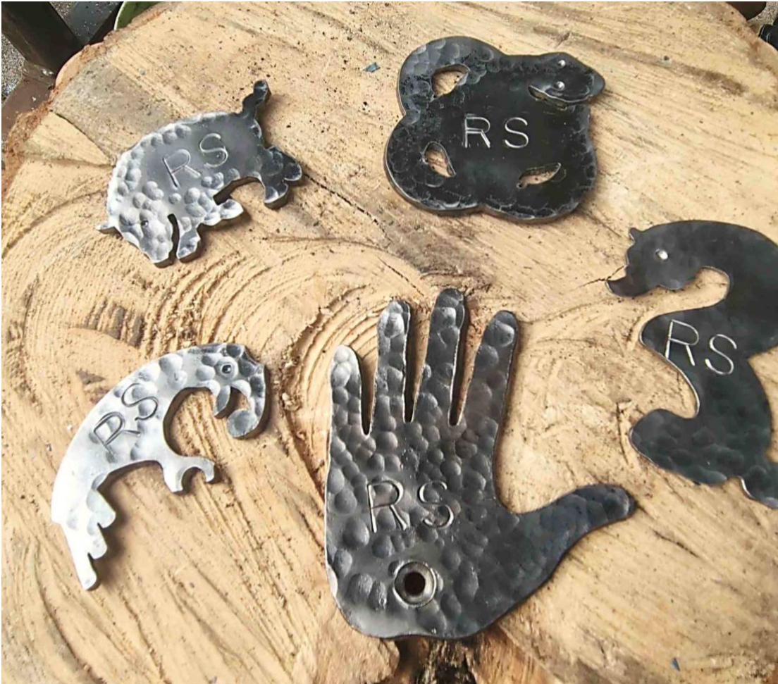
The Unity Shield Project

The Unity Shield project brought together residents from diverse backgrounds through blacksmithing workshops to create a permanent public artwork, which was unveiled on 21 March 2026.