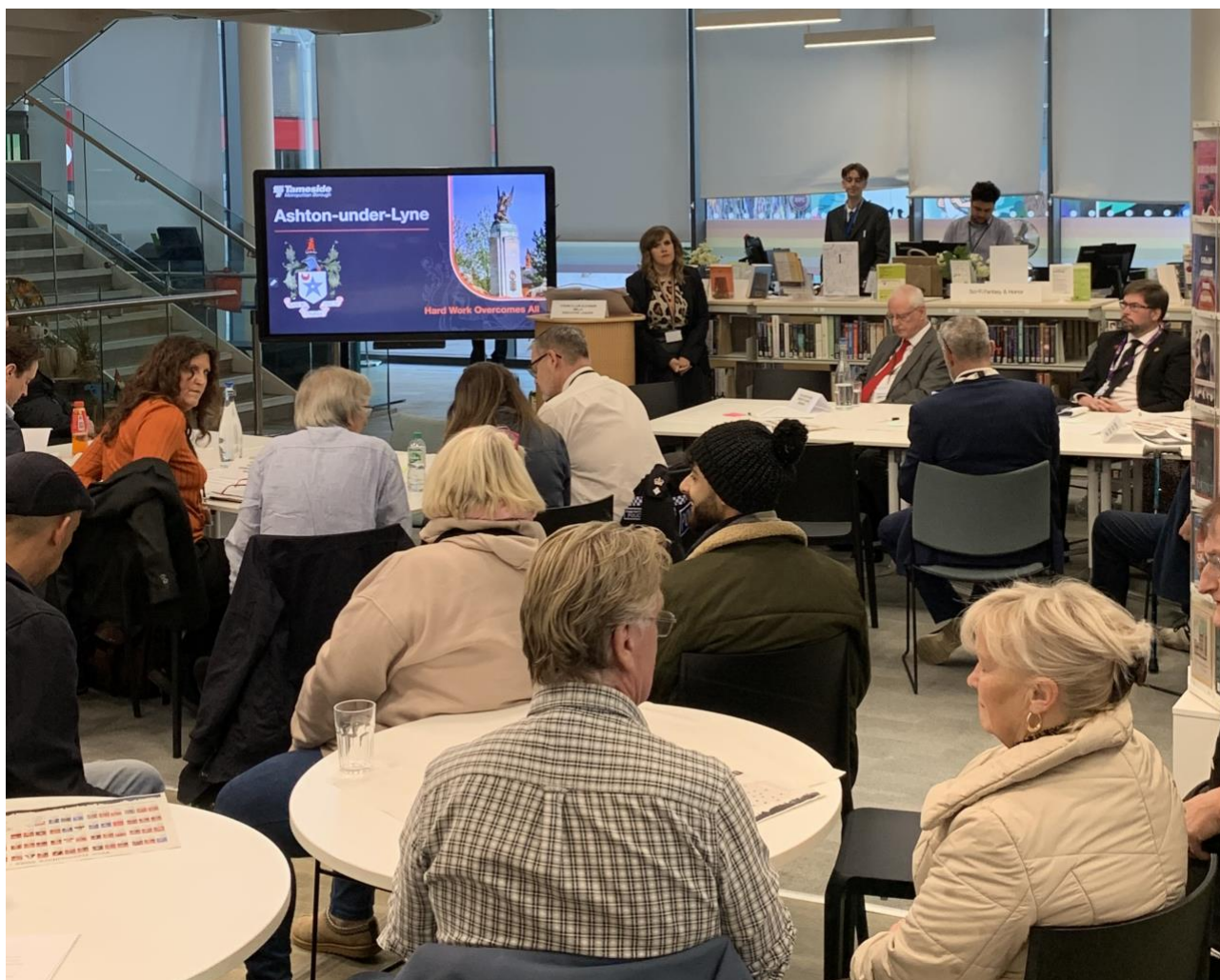
Town events with public and members

Cabinet in the Community meetings took place in all nine of Tameside's civic townships over a five-week period in September and October 2025. The agendas focused on open discussions led by executive members and supported by officers. Each meeting was customised for the specific town, with time set aside at the start to update residents on the Council's work and upcoming developments.