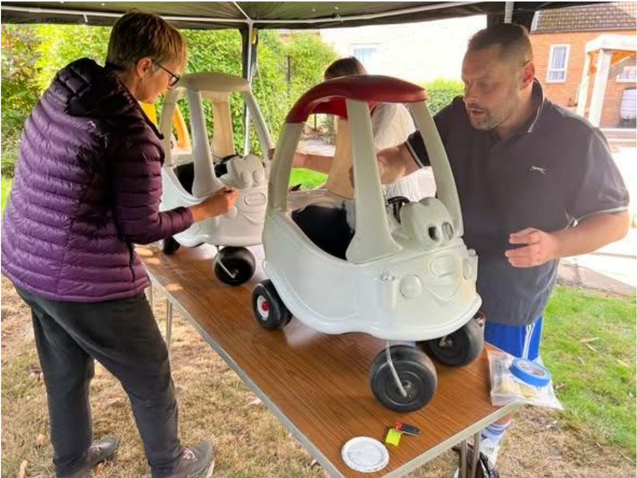
Turning toy cars into miniature council vans creative project