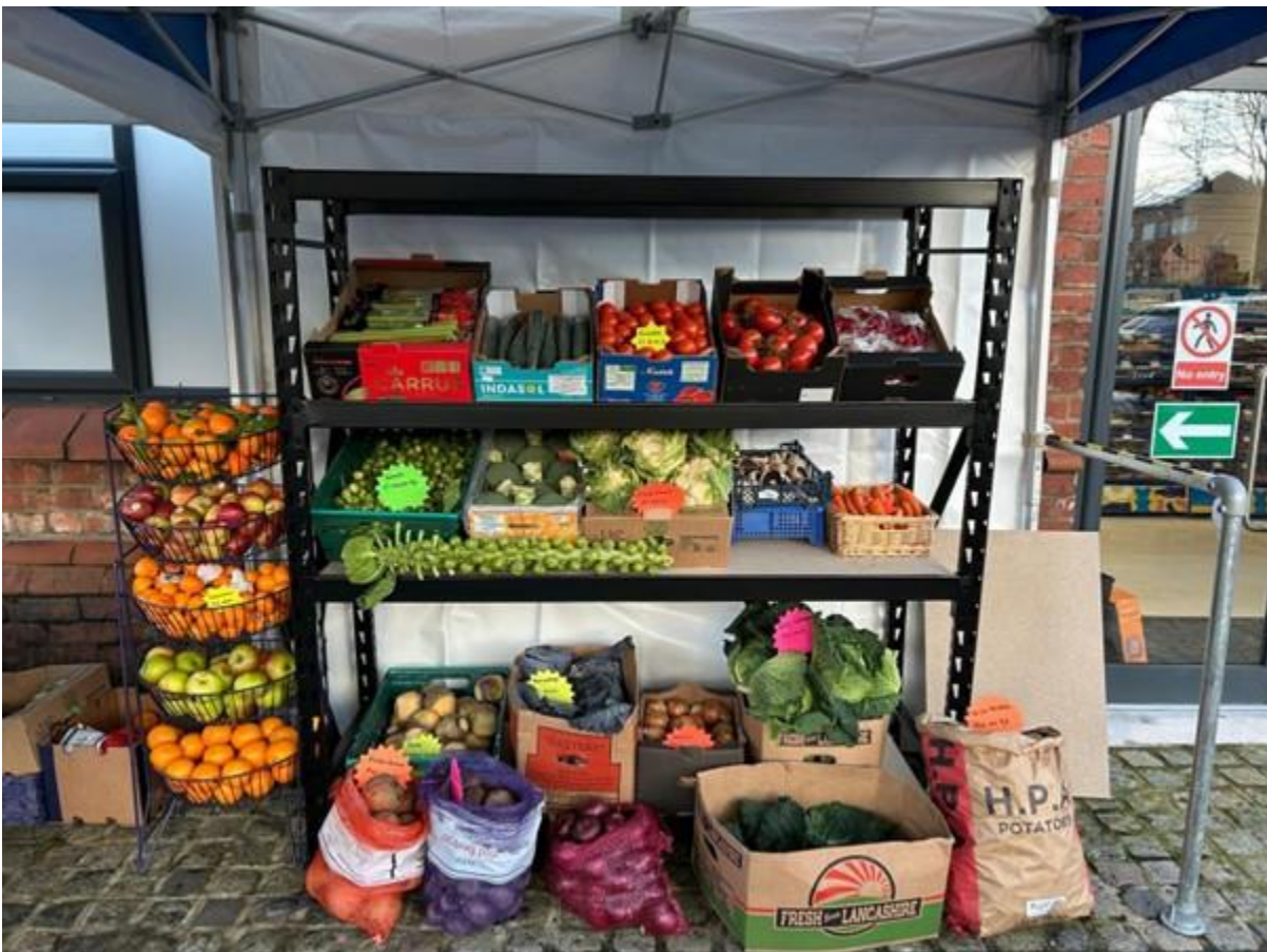
Leyland Community Greengrocers Market Stall

Supported by Cooperative Mutual Solutions, twice monthly meetings were established for the volunteers who started to bring this vision to life. Governance structures and principles were established based on democratic decision-making and a focus on social value. Roles were assigned to members based not only on their previous experience but also to give people the opportunity to develop new skills and experience while forming the cooperative.