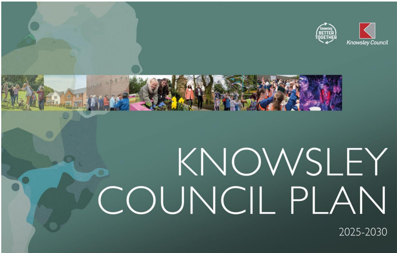
Knowsley Council Plan 2025-2030

In the first 9 months since the Knowsley Council Plan was launched, the practical, action-focused delivery plans which underpin it have enabled the Council to build further on its successes - delivering a wide range of tangible achievements which meet priority needs of local people and maximise social value across the Borough.