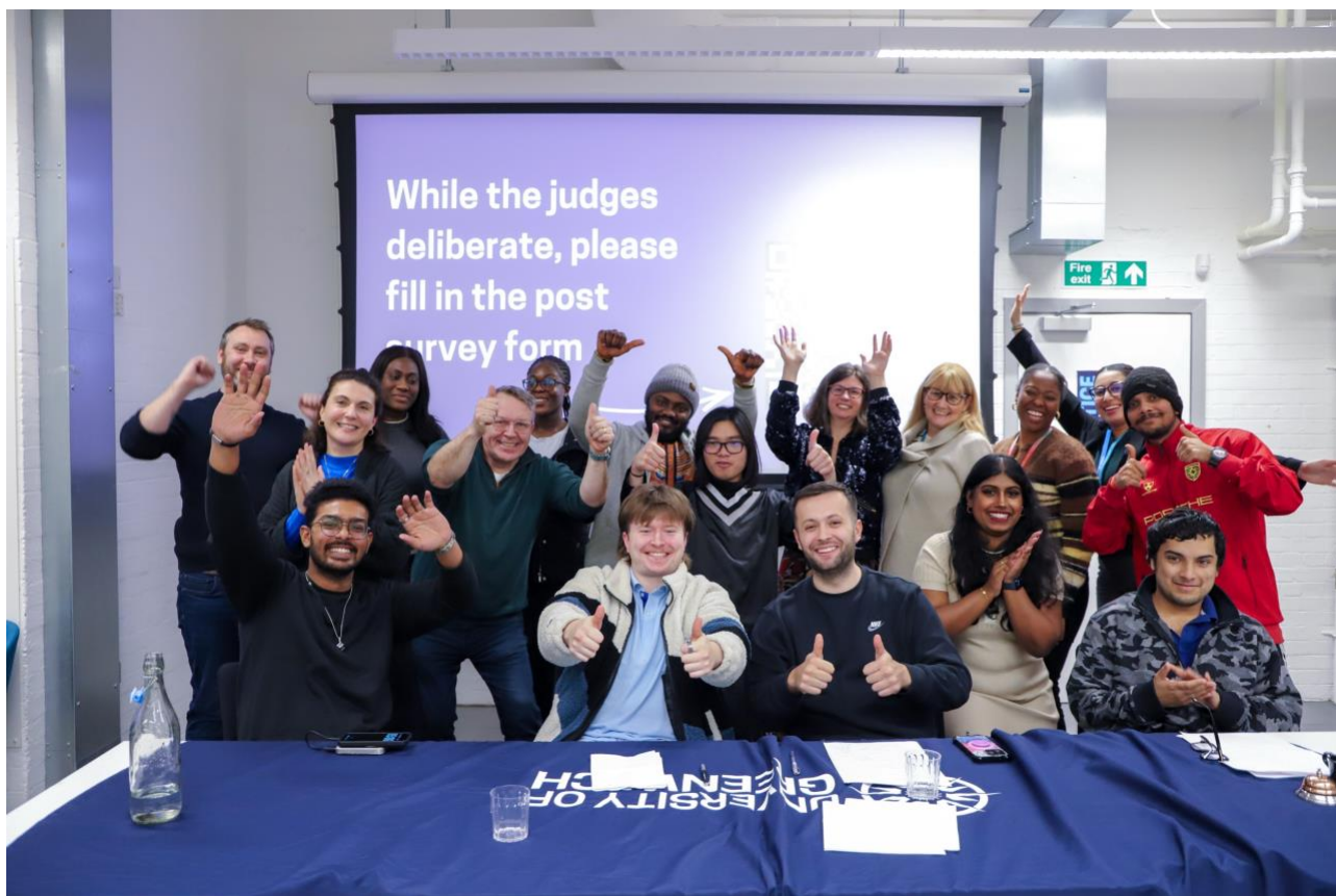
Royal Borough of Greenwich join forces with University of Greenwich students for the Care Re-imagined Hackathon

working, and public education campaigns to increase awareness and recruitment for care co-operatives.