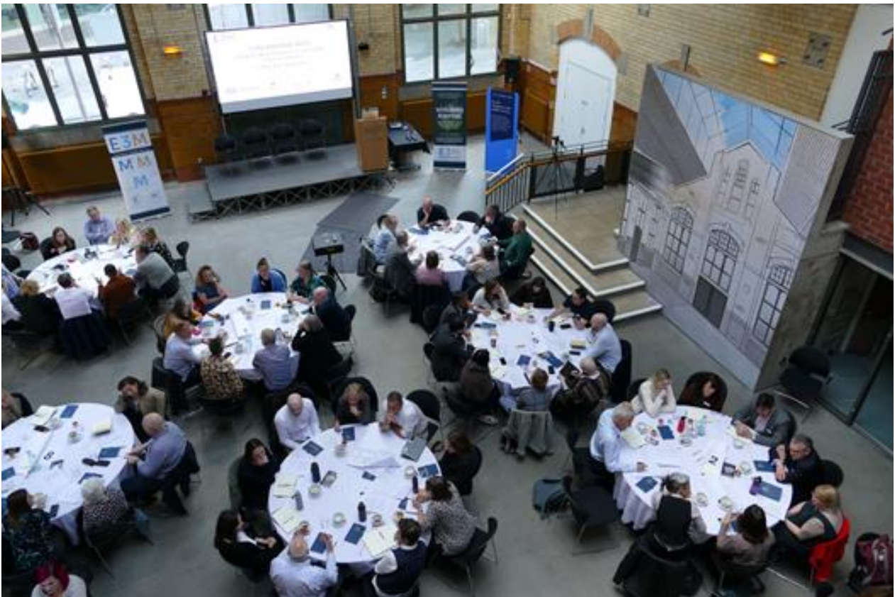
Developing and testing ideas at E3M Imagine

of the purchase, the council has committed s106 investments secured from developments to fund a near term set of required works to the buildings.