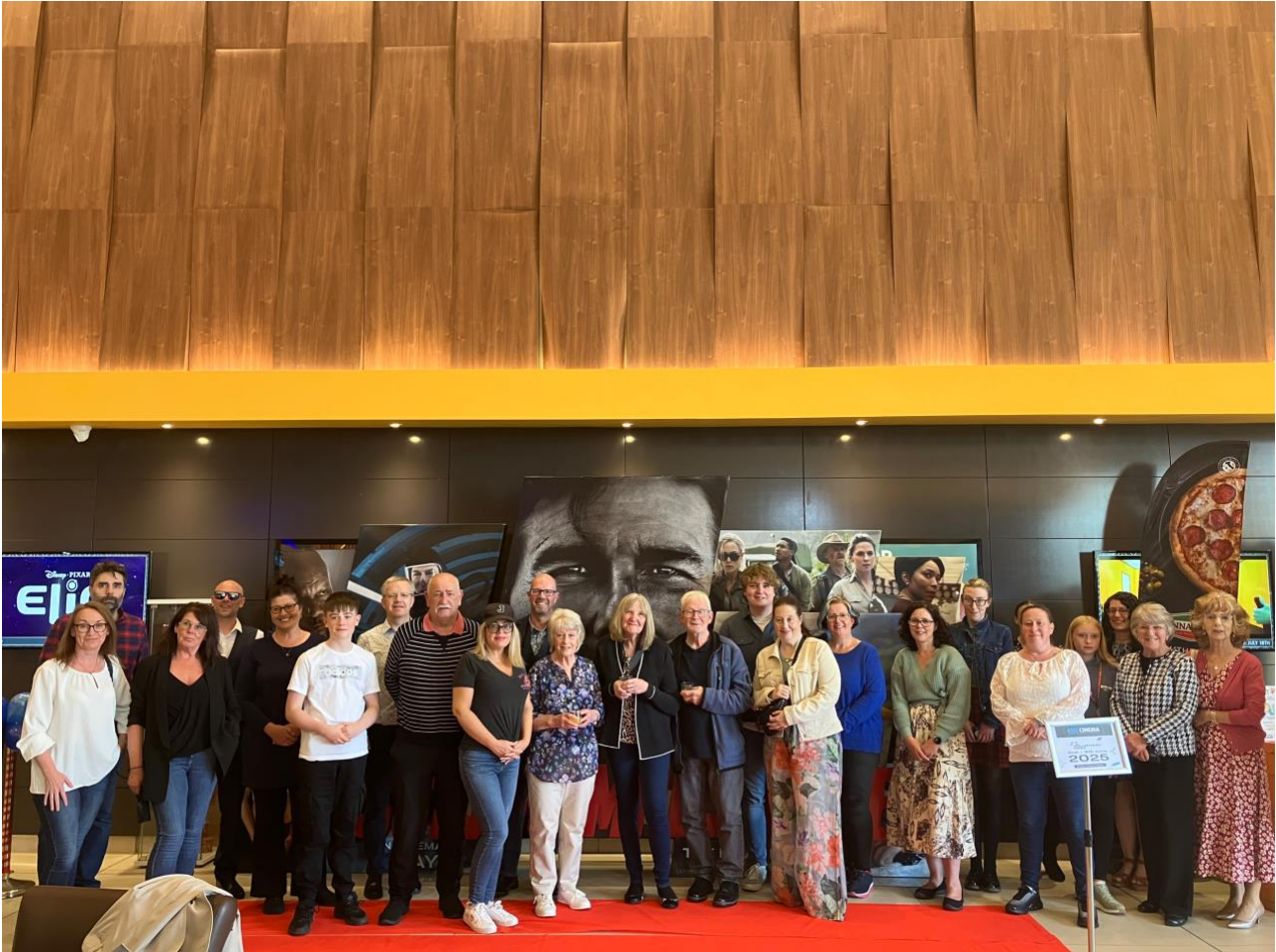
Chorley Together volunteers attending their reward event

Chorley Together also brings together representatives from the public sector, such as health and uniformed services, alongside social housing providers, to promote programmes that support residents and make referral pathways easier. It provides a vehicle for these services to consult with the VCFS to improve services and to provide valuable insight to either improve or create new services that address gaps in local provision.