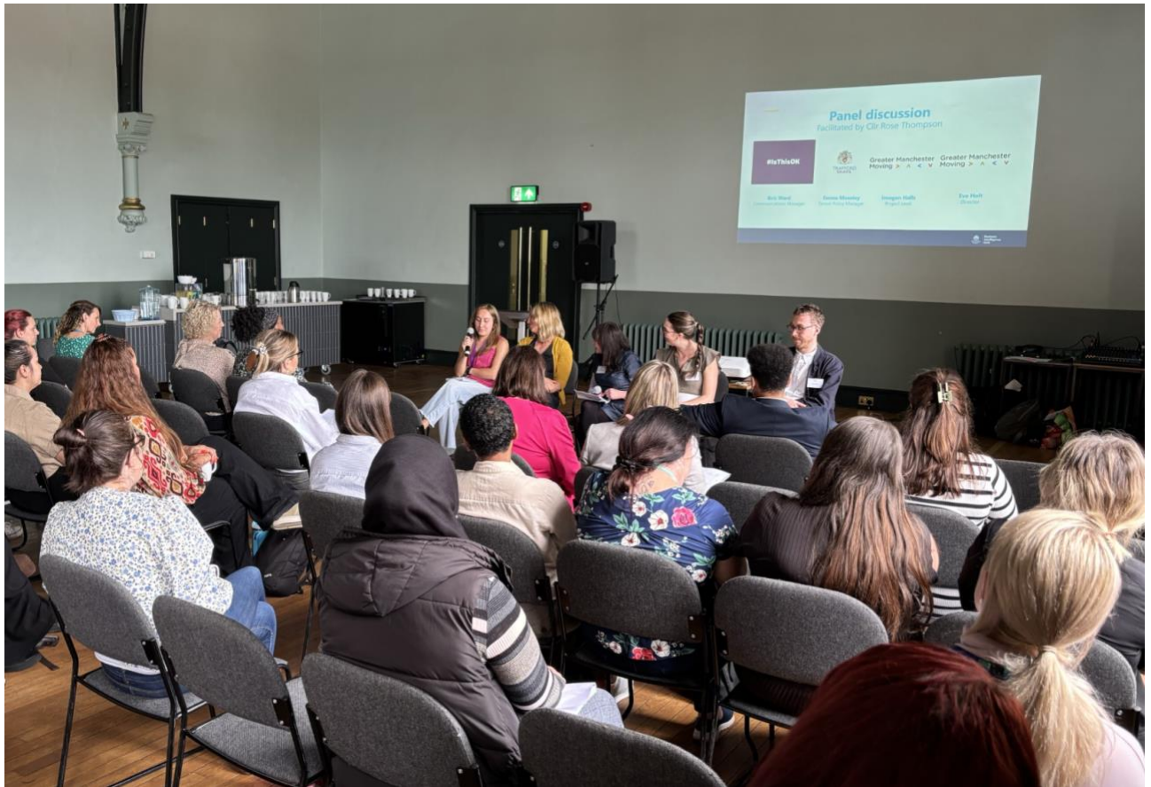
Trafford Council led partnership working to explore how to make streets and public spaces more welcoming from women and girls