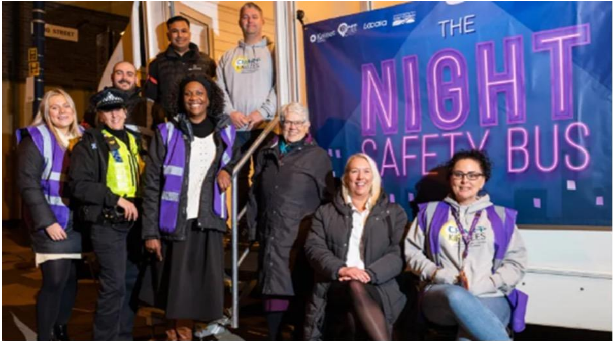
The Night Safety Bus in Kirklees remains operational and well supported by its Partners

Goal: To provide a safe, supportive and accessible space for people within the wider Kirklees Community at night.