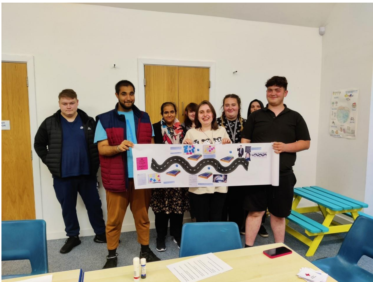
Local participants in the Economies for Healthier Lives project, Salford.

The Salford Local Anchors Network was established, involving local anchor institutions from the private, public and social sectors. We analysed their supply chain expenditure. With the anchor institutions, we identified local markets worth millions of pounds, such as catering, grounds and facilities maintenance, transport and care, in which social and co-operative businesses could operate.