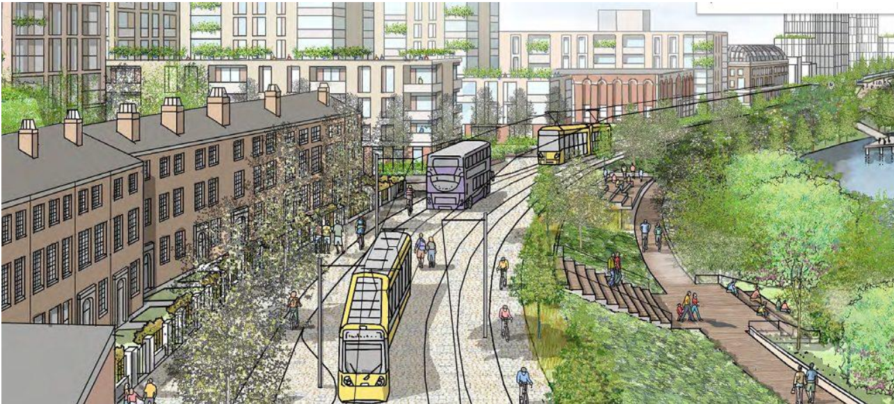
Crescent masterplan, Salford.

Salford’s refreshed Locality Plan 2025-2030 for health and well-being features Economies for Healthier Lives as a key deliverable for people and places in Salford, linked to the ambition for thriving businesses. The specific deliverables are: