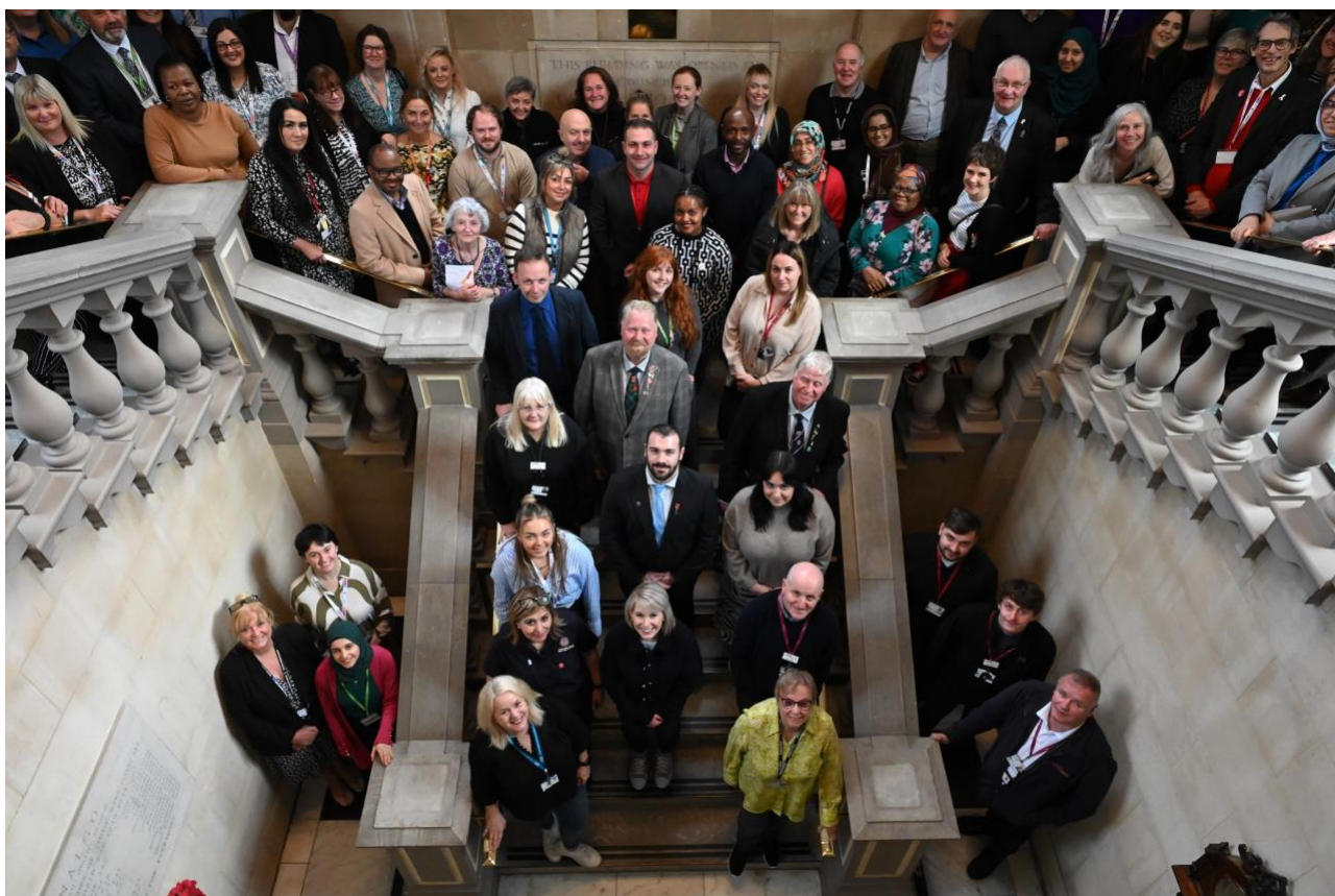
Attendees at South Tyneside's 'From Adversity to Diversity' Conference

The conference also created networking and dialogue opportunities for the diverse invited audience, including faith and voluntary group representatives, police, health, Council, and other professionals. The itinerary included an interactive workshop on protected characteristics, a session on asylum seeker and refugee support, and a 'market place' with information and leaflets from various partners. The event aimed to recognise and celebrate the contributions of people from diverse backgrounds, including immigrants, religious minorities, and people with disabilities.