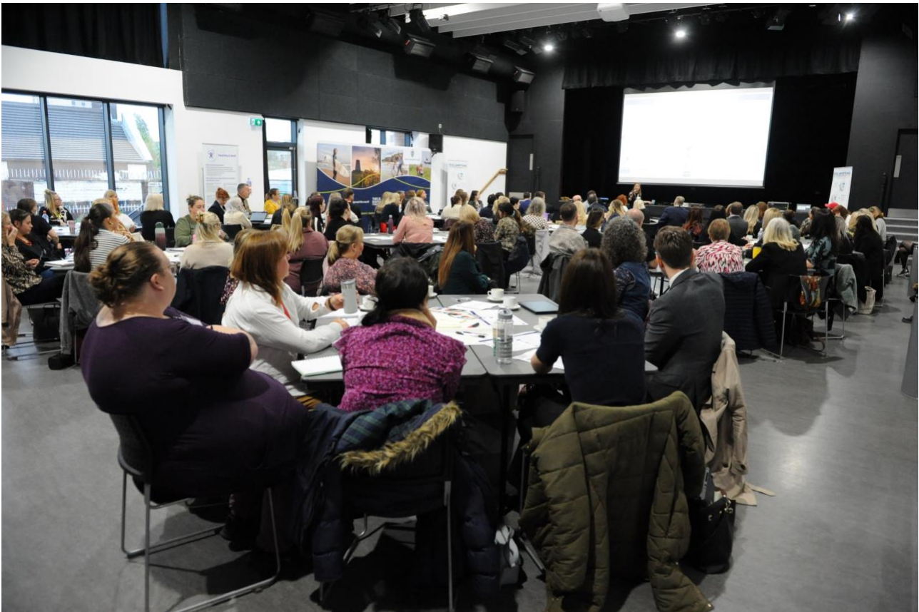
South Tyneside Child Poverty Summit 2024

day; promoting Free School Meals uptake; distributing baby boxes to new parents; providing further welfare support within Family Hubs; and expanding advice on money matters and sustainable cooking to parents within school settings.