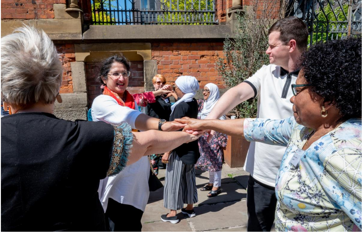
Elephants Trail at the Dream Weavers Festival (June 2022)

We want to spread and share the Elephants approach with communities and agencies, so that people can live meaningful lives with dignity and opportunity in supportive communities.