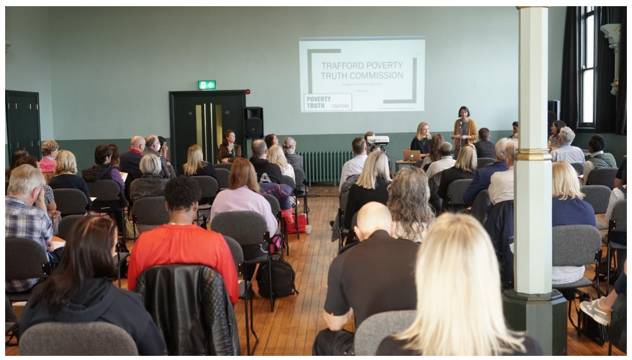
A real impact on the lives of those experiencing poverty

A tangible impact that the Poverty and Truth Commission has had on the lives of those experiencing poverty can be seen through recommendation one and the implementation of a One Stop Shop, now named the Stretford Advice Hub. This in-person service is available to all residents on a weekly basis, with attendance from Welfare Advice, Housing Options, Energyworks, digital support and ESOL classes, with more interested on becoming involved. Work is being conducted to develop a shared database amongst these services to mitigate against the exhaustion and frustration experienced by residents have to repeat their experiences of poverty and their story at each and every service provider they engage with.