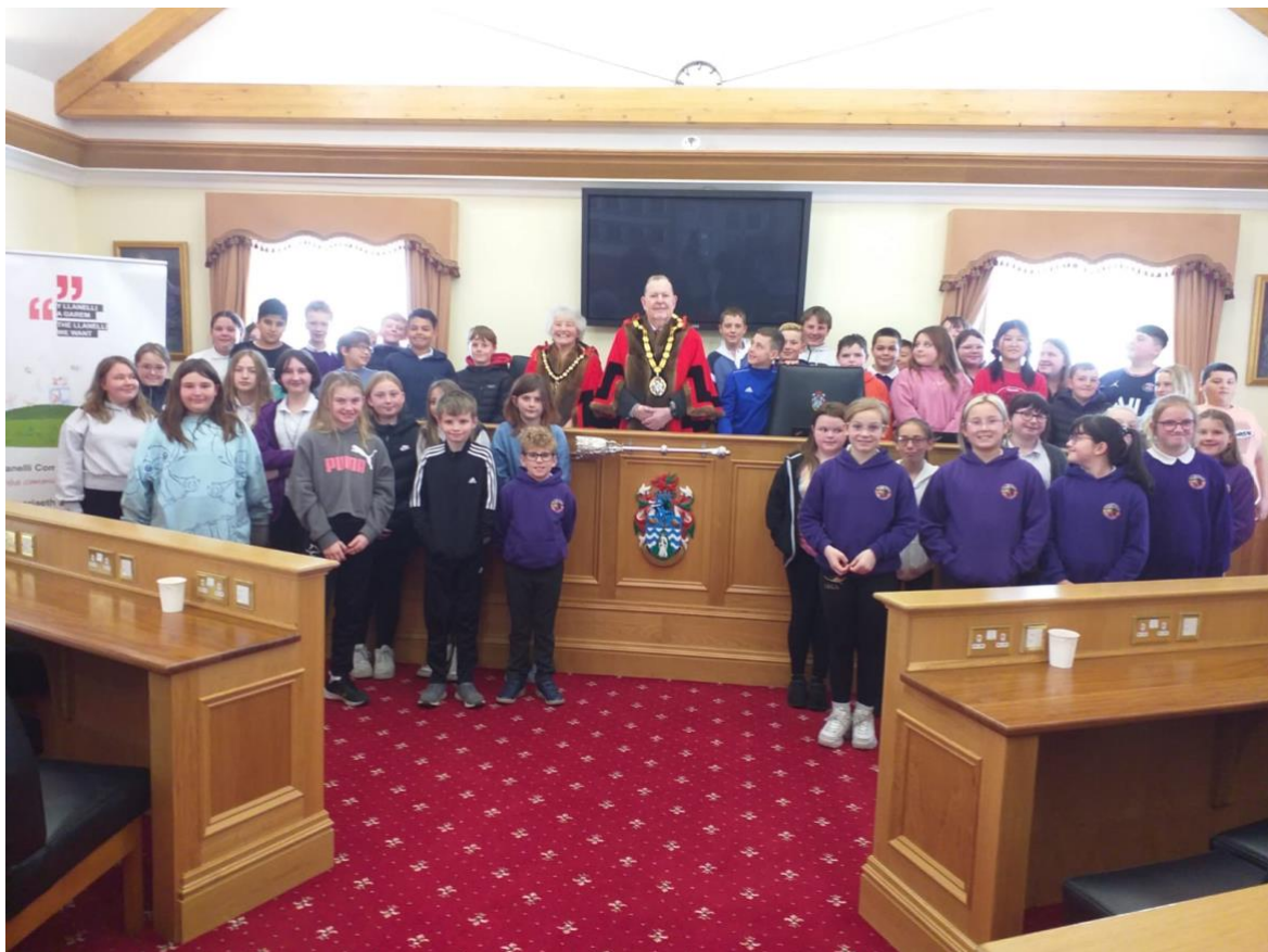
Meet the Mayor

Small-scale funding has been obtained from the Welsh Government, and plans are already developing for the April 2024 sessions, additional secondary school sessions, and the creation of a dedicated democracy page on the Council website.