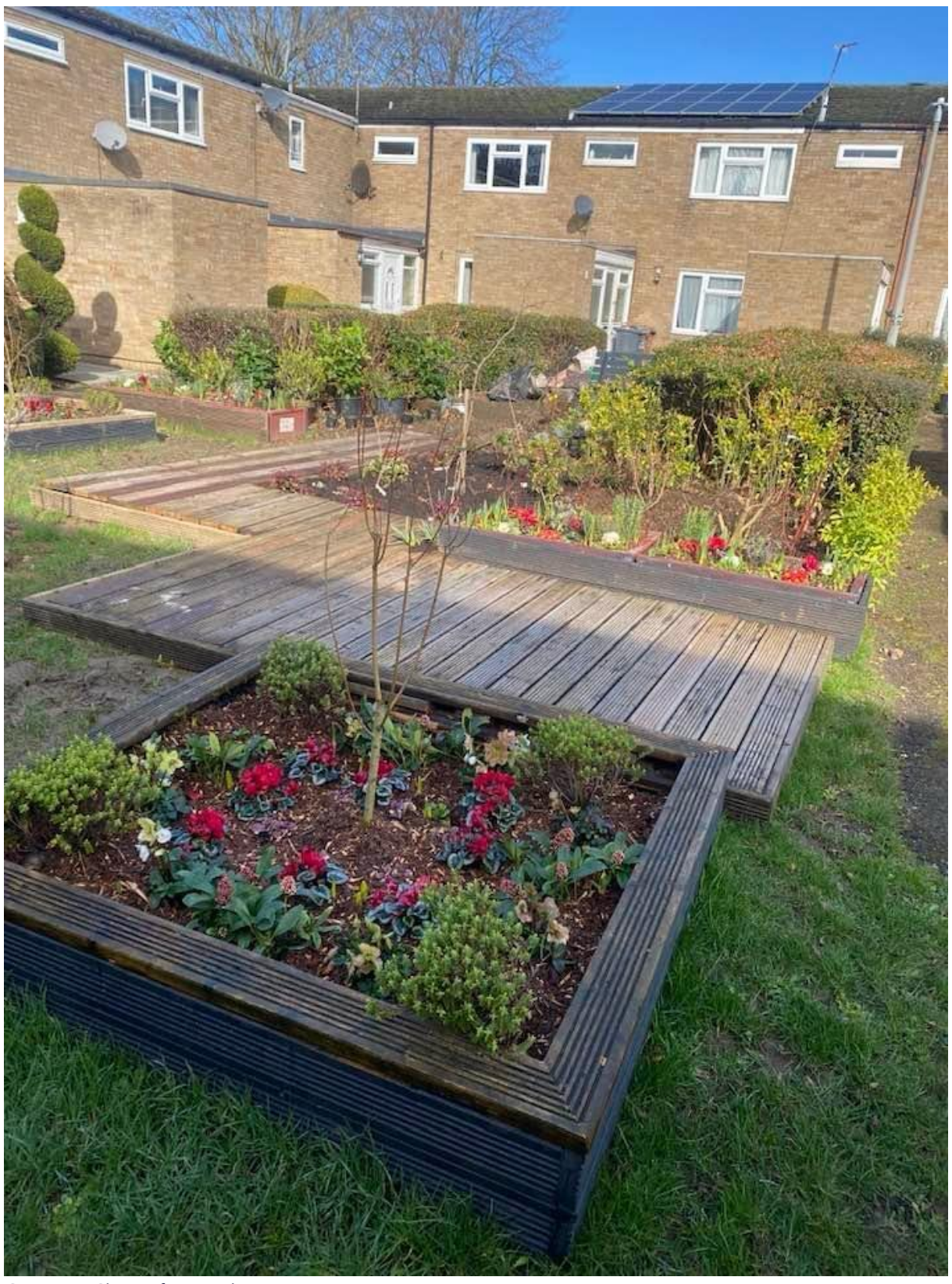
Coventry Close after works

Through these collaborative efforts, the revitalised space holds the potential of developing into a thriving community hub and garden. It's a space for everyone in Coventry Close to enjoy along with their family and friends. By fostering a sense of ownership, the project will create a lasting legacy that will enrich the lives of residents and strengthen the fabric of the community.