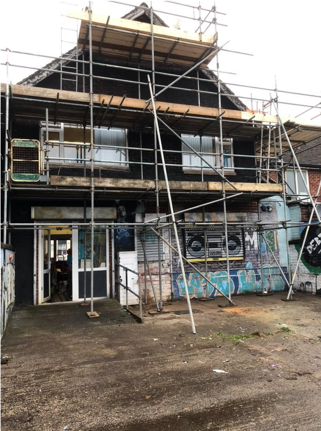
Retrofit works beginning at Soundskills April 2024

well as further training and education about the climate emergency and other environmental issues of concern to the local community.