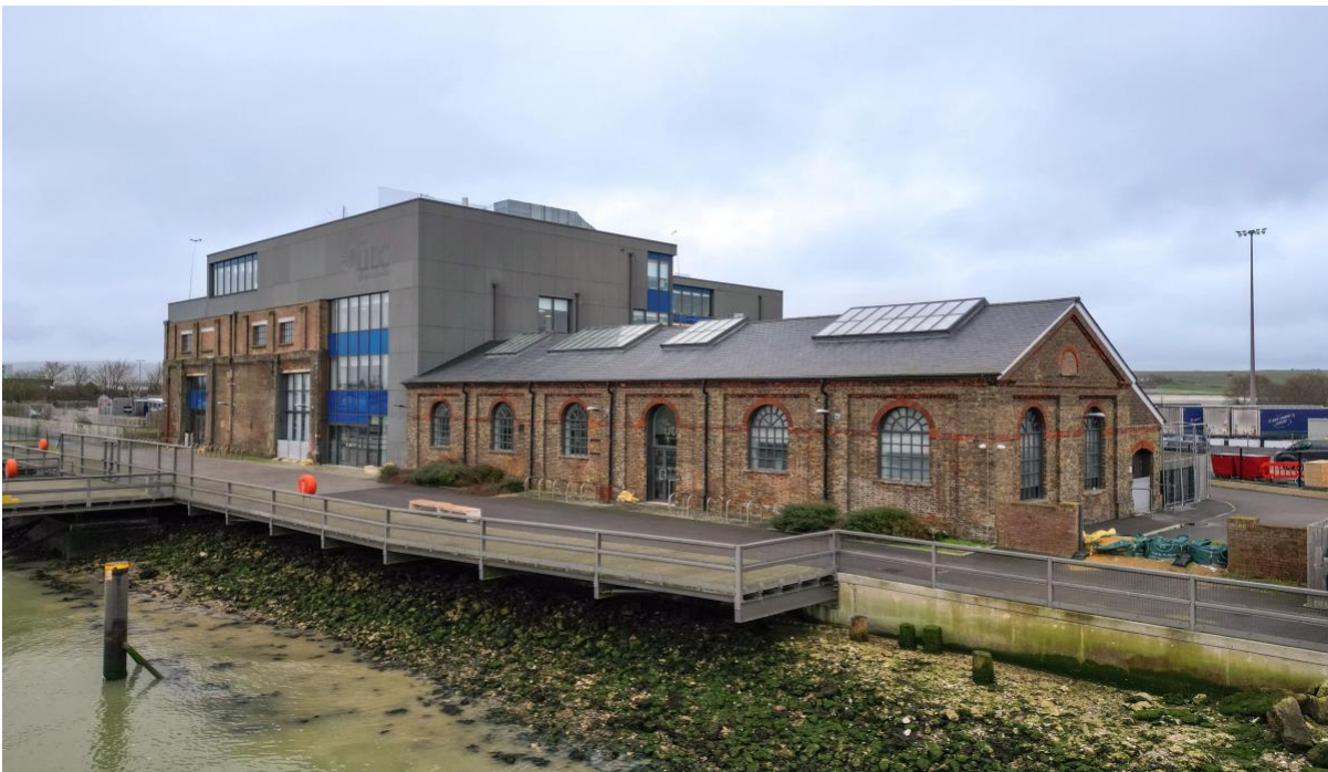
Marine Workshops, former technical college and new site of council offices in Newhaven

The council has maintained a presence in Lewes by repurposing a vacant shop in the town centre to provide a customer contact centre. Meanwhile, the former council office building in Lewes has been leased to Charleston Trust, an arts and heritage organisation who are using the building as a gallery and exhibition space which will contribute to community wealth by further developing the strong visitor and cultural economy of the town. Since opening its exhibition space in September 2023 Charleston in Lewes has welcomed more than 30,000 visitors and said early research indicates that three quarters of them have gone on to visit shops and other town attractions.