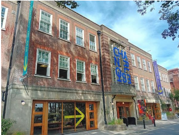
Southover House, former council offices now leased by Charleston Trust

Newhaven town. The building is being developed into a mixed hub supporting marine and education, commercial space and new public space.