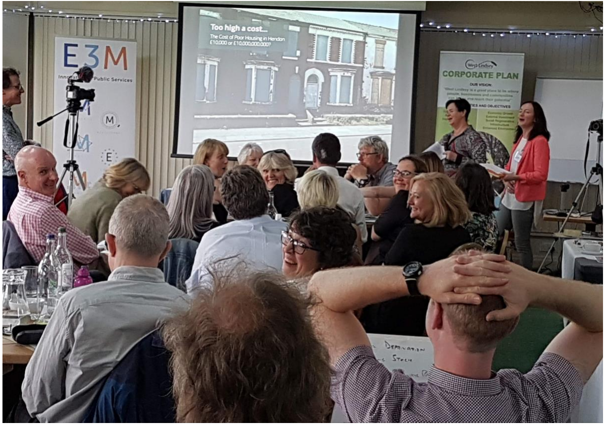
E3M Alchemy (West Lyndsey 2019)