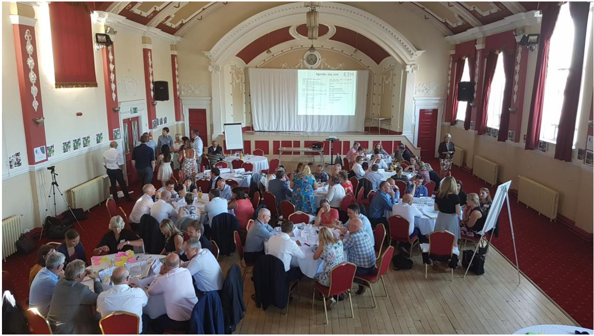
E3M Alchemy (Oldham 2018)

In Oldham, the Alchemy process supported the development of <u>Northern Roots</u>, the UK's largest urban farm and eco-park on 160 acres of green space in Oldham – a unique new community asset and visitor destination. Holding the Alchemy event engaged and empowered people to think differently and gave the council confidence that such a project could work.