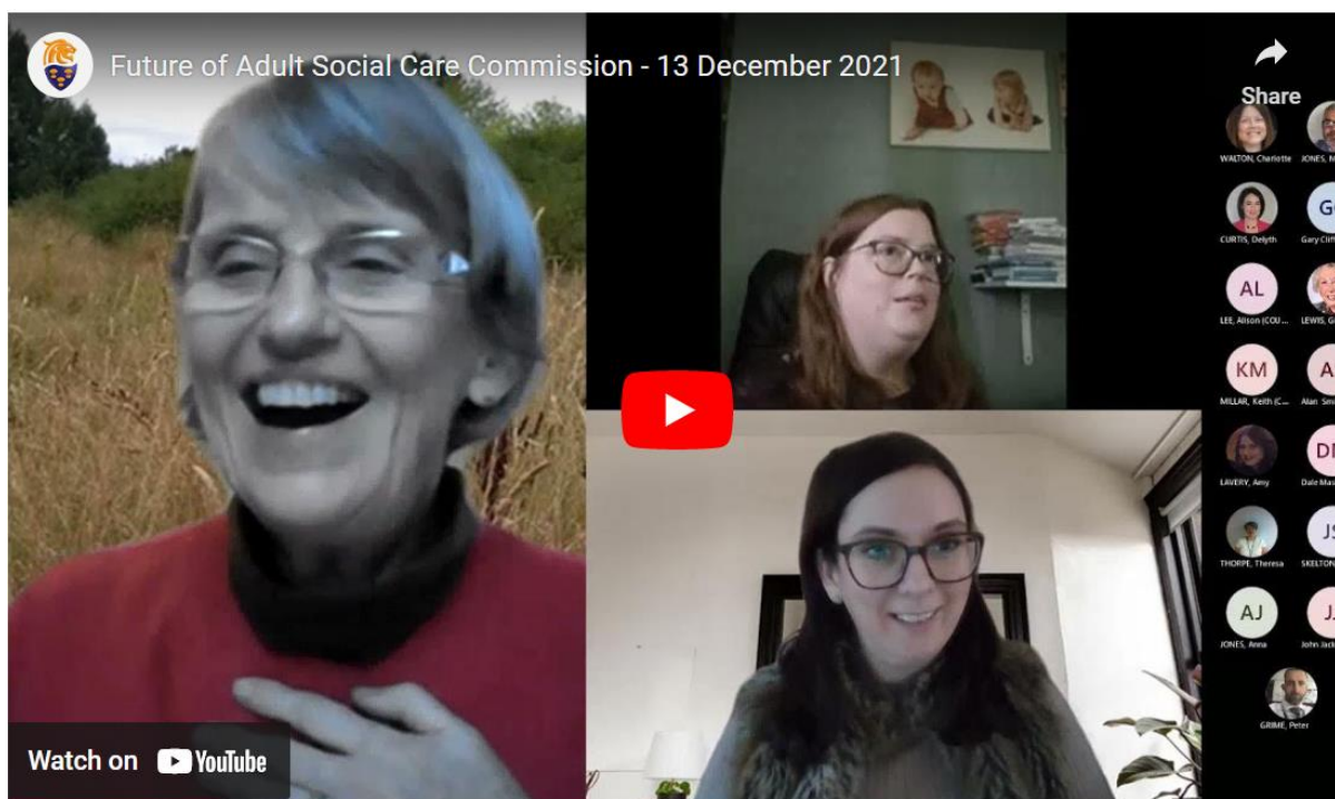
A discussion during the Commission's second meeting