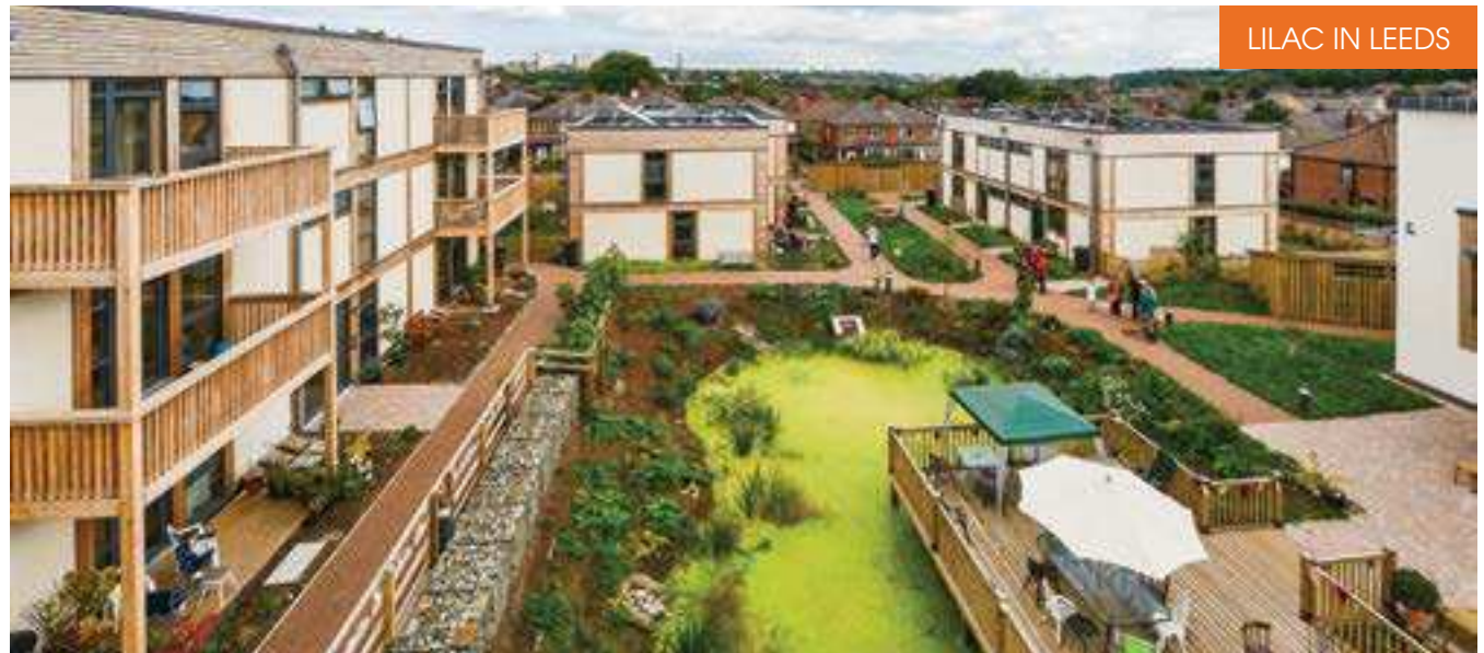
LILAC IN LEEDS

Almost all CLTs and cohousing groups have been established as group-led schemes. Other innovative CLH schemes developed in this way are LILAC in Leeds and Ashley Vale in Bristol.