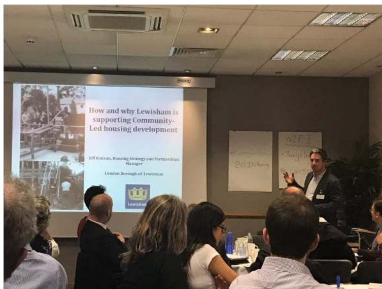
Commission evidence session in Croydon – November 2016