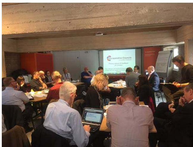
Commission evidence session at Rochdale Pioneers Museum – September 2016